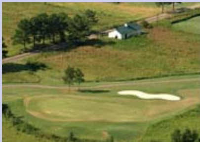
Golf packages available at Little River Golf & Resort

*We share resources; people, time, talents, gifts, ideas, educations and money. We believe we are all ministers of Jesus Christ through our baptism, called by God and empowered by the Holy Spirit to do God's work in the world and to be active leaders and participants in our congregations and in our cluster.